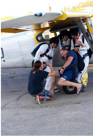
Pre-Demo Camera Fun