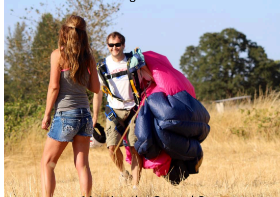
Meeting the Ground Crew