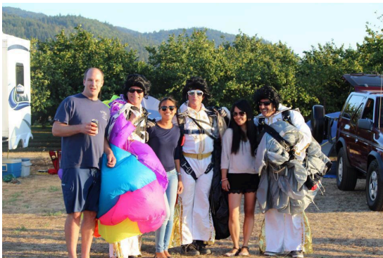
Flying Elvis Impersonators and Fans*