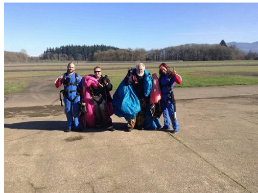
First Tandems Back On Airport*