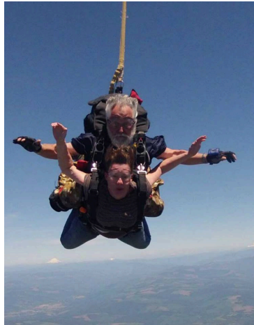
Tandem Over Creswell Airport*