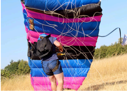
Landing On Target